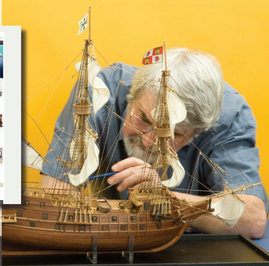
Above: Hobby's new online store Right: Creative photography