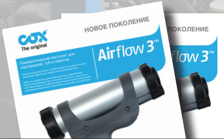
Top: Landing page of the new global website Above: Product brochures Right: Internationale Eisenwaremesse Exhibition Cologne, Germany